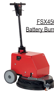
FSX450 Battery Burnisher

for details on the full range of industrial floor cleaning equipment or call our sales office on Tel:0121 706 5771.