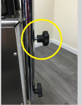
2. Leave the top wing nuts loose for the basket to be mounted.