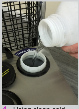
4. Using clean cold water fill the reservoir and replace cap.