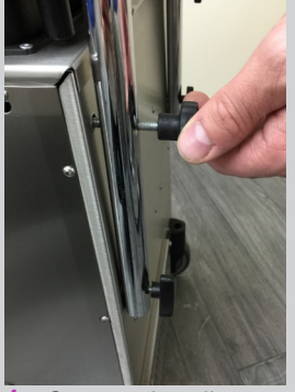
1. Connect handle to the back of the machine using the 4 wing nuts provided.