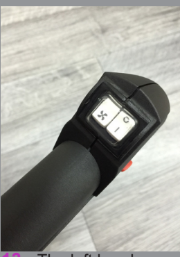
13. The left hand switch will activate the vacuum and the right hand momentary switch is inactive on this model.

12. The red trigger will release steam when pressed. The button will lock the steam trigger in the off position.