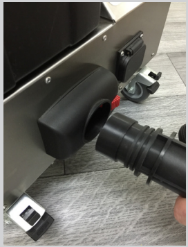
5. Connect vacuum hose, clicking it into position.Ensure it cannot be pulled out.