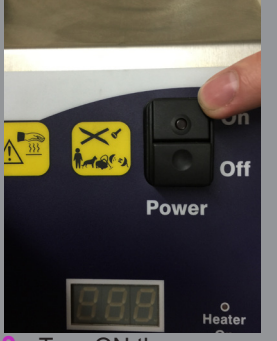
9. Turn ON the machine with the on/off switch.