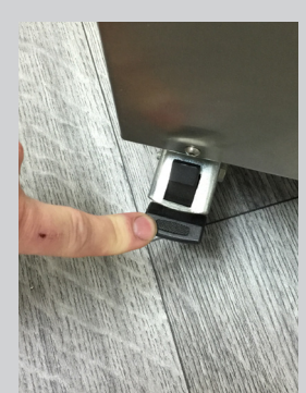
7. Push your machine to a suitable area and lock the brake lever to avoid the machine moving during use.