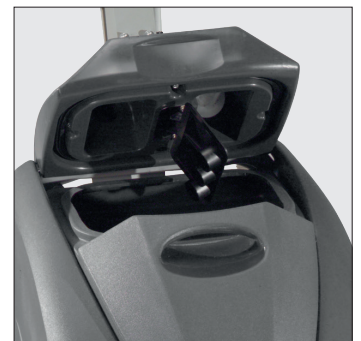
Overfill Cut-off System