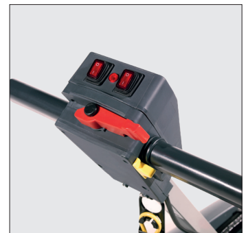
Simple Operator Controls