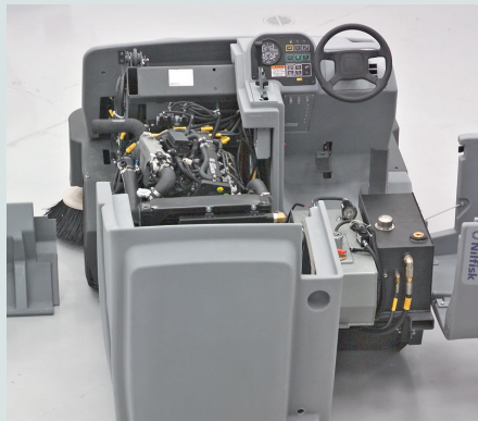
The Nilfisk NoTools™ system makes service extremely easy. The 5-sided access to engine and hydraulic components saves you valuable time and keeps down the service cost