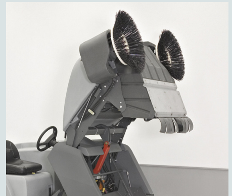
The SW8000 has a superb high-dump capability up to 152 cm from ground level for easy and convenient emptying