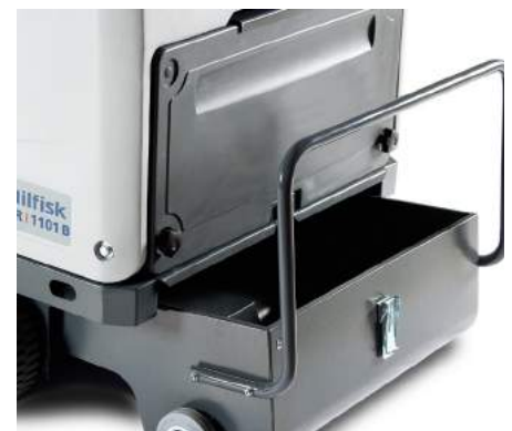
The hopper capacity is extremely large to extend operational time