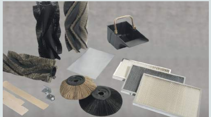
Large range of optional accessories provides the right tools for specific jobs e.g. carpet kit, special filters and brushes, overhead guard, 2x18 litres hopper containers etc.