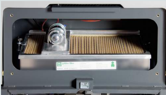
An electrical filter shaking system cleans the filter automatically every 5 minutes