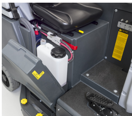
Ecoflex chemical kit (optional): easy to access detergent cartridges