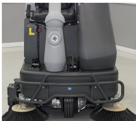
Dual side brooms (cylindrical models) deliver true edge cleaning