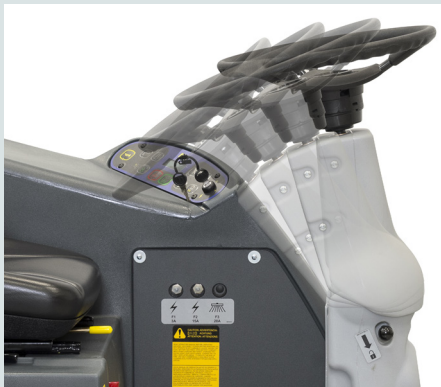
Ergonomically designed operator compartment with tilting steering wheel for easy access, operator comfort and safety