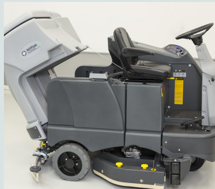
Tip-out and lift-off recovery tank