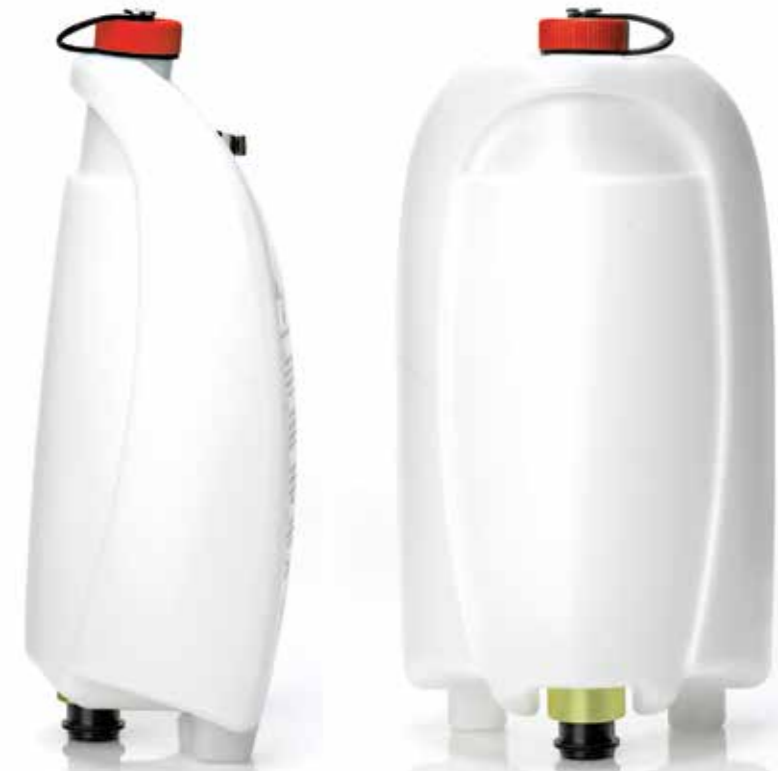
solution tank red ● sanitary fittings & washroom floors