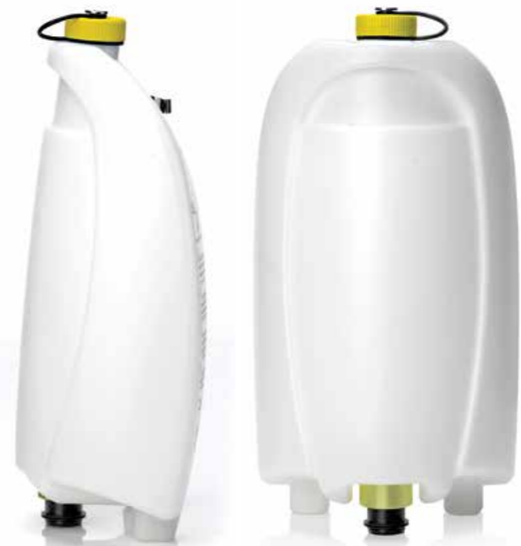
solution tank yellow ● wash basins & washroom surfaces