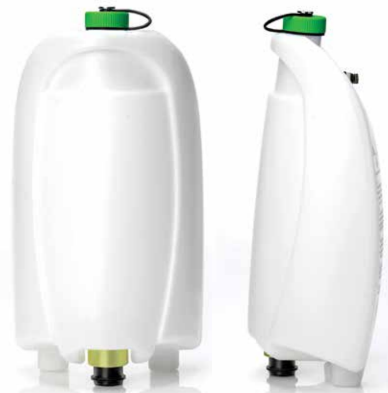
solution tank green ● general food&bar use