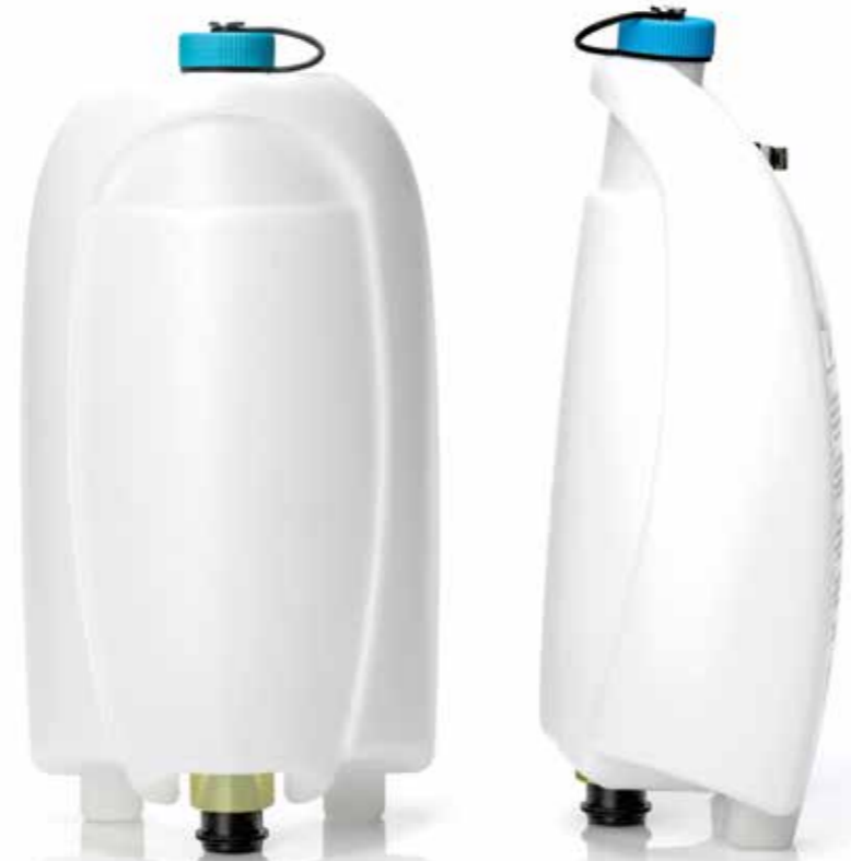
solution tank blue ● general low risk areas