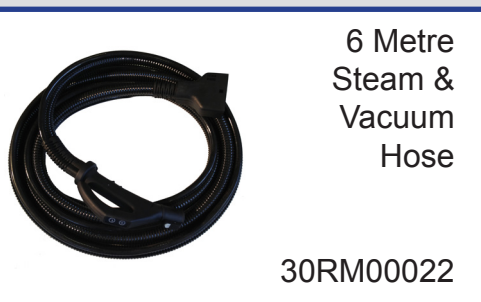
6 Metre Steam & Vacuum Hose