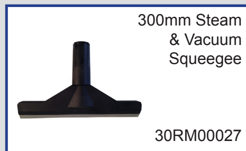
300mm Steam & Vacuum Squeegee