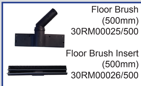
Floor Brush (500mm) Floor Brush Insert (500mm)