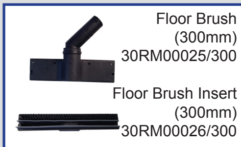
Floor Brush (300mm) Floor Brush Insert (300mm)