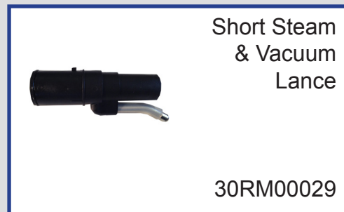
Short Steam & Vacuum Lance