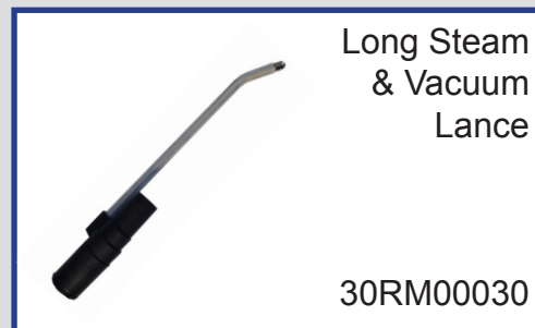
Long Steam & Vacuum Lance