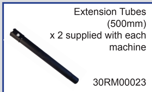
Extension Tubes (500mm) x 2 supplied with each machine