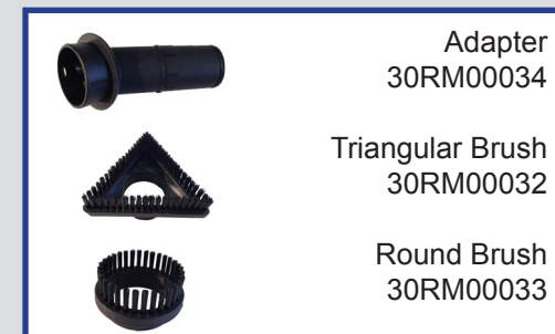
Adapter Triangular Brush Round Brush